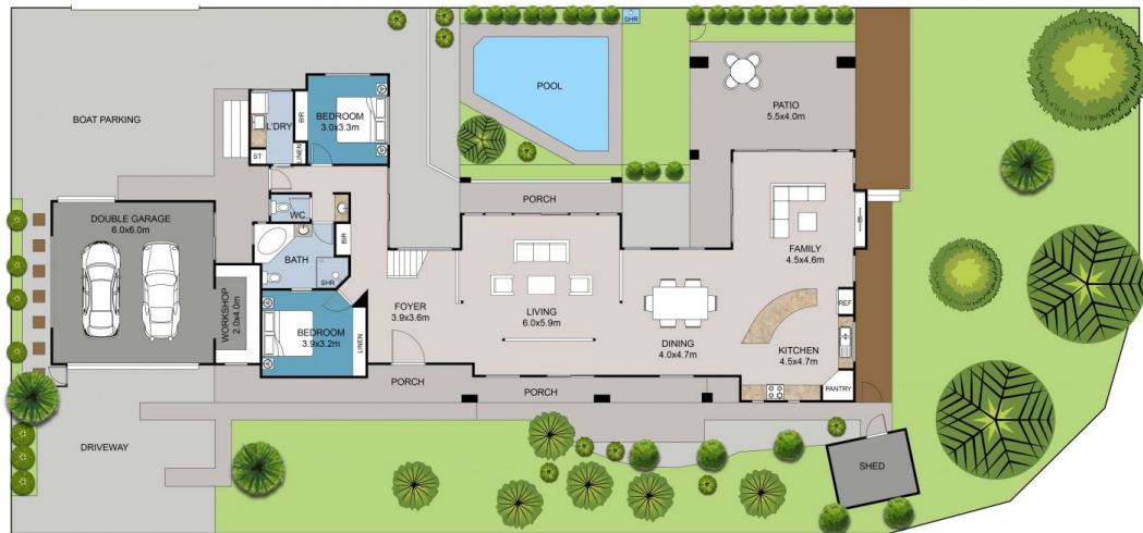
LOWER FLOOR PLAN ON SITE